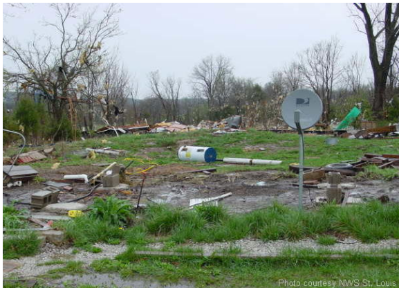
Figure 2. Site of the fatal destruction of a mobile home near Fulton, MO, by a rain-wrapped, F1-rated tornado on 10 April 2001; see Glass and Britt (2002) for meteorological documentation. At DoD 9 (complete destruction of unit), anywhere from EF1-EF3 can be assigned for this DI, with an EFkit default of EF2. The lack of damage to surrounding trees, and to the adjacent satellite TV receiver, indicates EF0 may be the most appropriate rating.

3. What can be done to improve DI representativeness? What new DIs should be added, how, and why? Efforts will continue to explore new potential DIs, especially for objects and structures more commonly found in rural and remote areas that