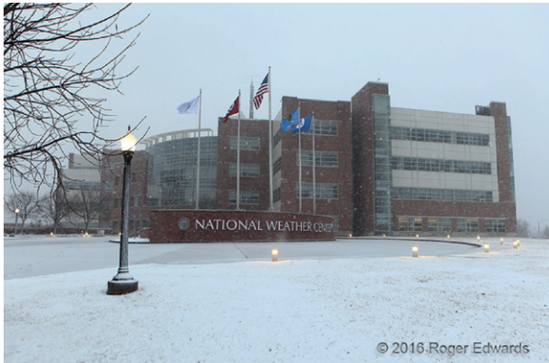
Fig. 1. Photo of the NWC, a facility on the south campus of OU that houses many agencies of the weather enterprise.

home to numerous partners of the weather enterprise, including the SPC, the Norman NWS Forecast Office, the National Severe Storms Laboratory (NSSL), and the NWS Warning Decision Training Division (WDTD), along with other OU meteorological entities, including the SoM and the Center for Analysis and Prediction of Storms. The collocation of these agencies inherently supports an R2O framework, and it helps to break down barriers otherwise present in collaborations over physical distance. Since its opening in 2006, the NWC has served as a fertile ground for intra- and interdisciplinary projects resulting from regular contact among a diversity of occupants.